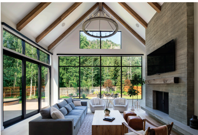
25-foot ceilings and windowed walls in the central living space create a sunlit atrium in spring and summer, and snow-globe effect during the winter months.

The family sought refuge from the pandemic for a year, using the small condo as a home base. However, the three school-aged children were vehemently opposed to the idea of returning to their full-time California residence. So, they gave up an idyllic farm property for a new dream.