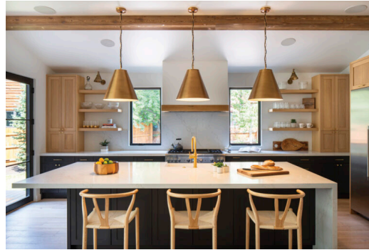
Minimalism and functionality are both at work in the kitchen-where natural wood and open shelving make the space both cozy and inviting.

Below, in the garage, is a veritable sporting goods store with snowboards, skis, gear bags, and a bicycle repair center with an enviable workbench. "I'm a bit OCD and a gearhead, so the space needed storage and functionality," says the busy father of the home. Appearing almost as art in a wood-lined recess, more than a dozen fly rods stretch across one wall. The uppermost rods were a gift at age ten from his grandmother, a fisherwoman of note in her day. That passion is in its third generation, with the eldest son now a youth state title holder.